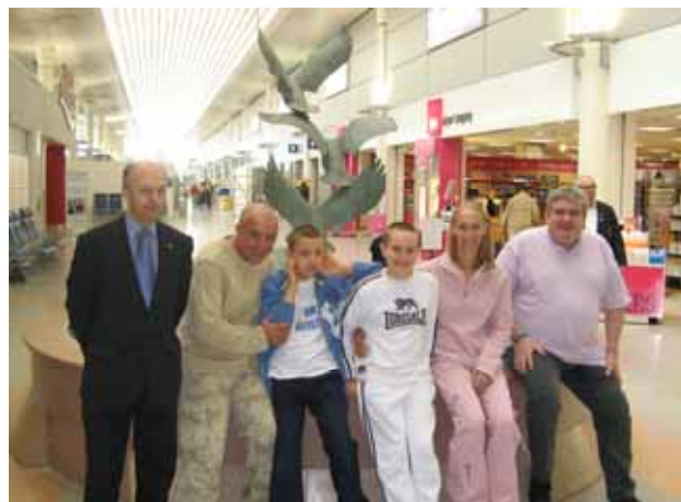
All set for the trip!!!!