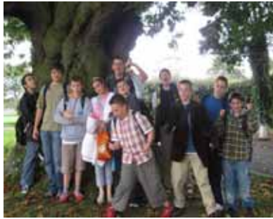
Chilled out trip to Guernsey

The project oversees the continued running of the "Chilled Out Club" on a Tuesday night at the Move on Youth Café in Liberation Square for young people on the Autistic Spectrum in years 9 and 10. Currently there are 14 young people on the Autistic Spectrum and 5 'neuro typical' buddies who attend the club.