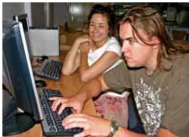
Local Befriending at work!