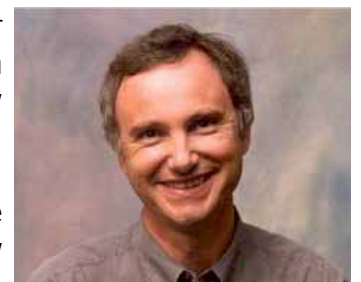
Professor Tony Attwood

In May 2006 we were fortunate to secure a full day, 2 session seminar with Professor Tony Attwood, one of the worlds leading experts on Aspergers Syndrome. We had hoped to sell 150 tickets, but on the day found ourselves cramming over 230 people into the hall at the Bridge!! We even had to borrow some chairs as we didn't have enough – and don't mention the fact that the borrowed chairs were delivered to the Bridge pub at the Weighbridge before ending up at the venue with only minutes to spare!!