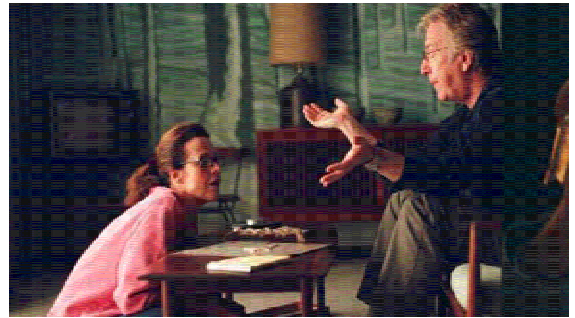
Alan Rickman & Sigourney Weaver