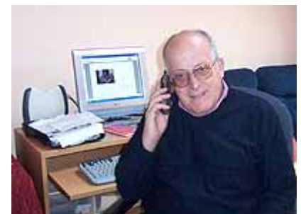
A Parent to Parent Volunteer

Last year, we launched the National Autistic Societies "Parent to Parent Line" at a seminar that we held for the Islands GP's. Parent to Parent line is a free, confidential telephone support service offered by volunteer parents to other parents of an adult or child with an autistic spectrum disorder. If you need someone to talk to in a sympathetic, totally non judgemental and anonymous way, the Parent to Parent line could be just what you are looking for. It has the advantage (or disadvantage depending on your perspective!) that none of the volunteers are from Jersey, so you won't be talking to somebody that knows you.